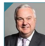
Sir Oliver Heald

MP, Joint chair, TCA Parliamentary Partnership Assembly